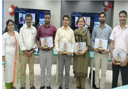
2 nd Prize