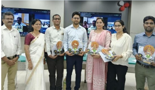
1 st Prize