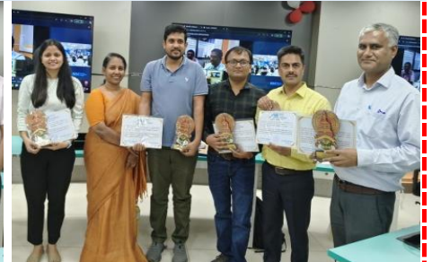
3 rd Prize